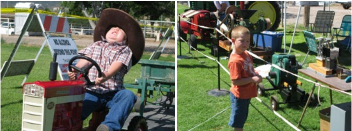
Potential future members